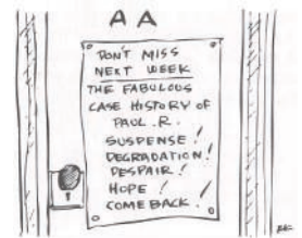
"I'd love to be a member, but do I have to remain anonymous?"